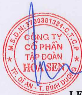
LE PHUOC VU